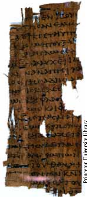
Princeton University Library

A more usual format was quires of 8–12 leaves, joined as needful. The main advantage of this was that more material could be contained, and more easily consulted, without the volume becoming unmanageable. P46, referred to above, originally contained all the Pauline epistles except Timothy and Titus. As a scroll this would have needed one