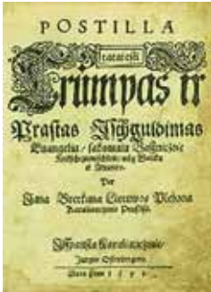
Postilla by Jonas Bretkūnas

To counteract this growing influence, the Roman Catholic Church was forced to use Lithuanian and to print religious books in Lithuanian. The first Vilnius-printed books in Lithuanian 12 were the 1595 Romanist Catechism and a Postilla of 1599, both