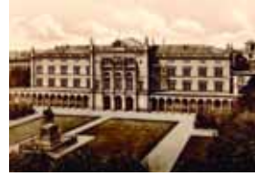
The New University of Königsberg in 1862.

The Baltic languages do belong to the Indo-European group of languages, Lithuanian and Latvian having common form as recently as the 5th–7th centuries AD. Lithuanian, though, only existed in oral form—that is, only as a spoken language—until the 16th century. Indeed, the language had no settled or agreed consistent written forms until the end of the 19th century. Numbers of Lithuanian words are used by Belorussians and Poles, reflecting former Lithuanian influence, and Lithuanian names for rivers and lakes occur from the Vistula to the Kama and Moscow Rivers. Words of Lithuanian origin account for more than one percent of Finnish vocabulary. In Medieval times all written communication