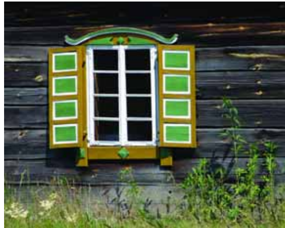
The window of a traditional home in Rumsiskes, Lithuania