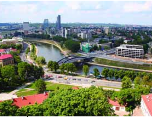
Vilnius, view from the Gediminas Tower

Children were taught to read in secret from Bibles and prayer books. 13