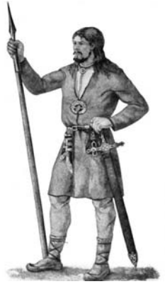
Early Finnish dress

Finland! Henry was murdered by a Finnish peasant, but later became Finland’s patron saint. A second and third northern crusade followed, and by 1293 the eastern border of Finland had become the northernmost demarcation between Catholic west and Orthodox east.