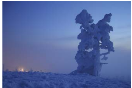
A tree encased in ice and snow

Finland is dotted with countless lakes 5 covering at least one-tenth of its area, and linked by Europe's most extensive inland waterway system. Most of the lakes are of English Lake District sizes, about 10 sq. miles or less, but Lake Saimaa covers 1,700 sq. miles. Generally low lying in the south, the undulating landscape rises to the north, and the highest mountain, Mt. Haltia on the Norwegian border, is over 4,000 feet high. The town of Rovaniemi is on the Arctic Circle, and from there northwards the 'midnight sun' can be seen throughout June and July; the rest of the country just has all night twilight. These exotic details must be put alongside February temperatures of minus 30°C, and snow accounting for well over a third of the annual precipitation. Heavily forested with pine and spruce but also birch and maple, home of bear, wolverine, elk and lynx as well as reindeer, Finland can well be considered, in its landscape, history and people, a deep secret, hidden in full view.