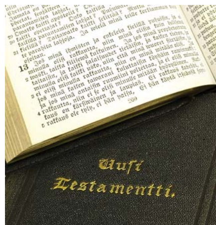
1885 TBS edition of the Finnish New Testament open at 1 Corinthians 13

Through the 18th century the printed Bible became quite scarce in Finland, and matters didn't improve under Russian influence in the 19th. Funds derived from the corn tithe intended to be used for Bible publication became lost in general state expenditure. The British and Foreign Bible Society began to publish the Finnish Bible quite soon in its ministry, using presses in Turku. These were destroyed in