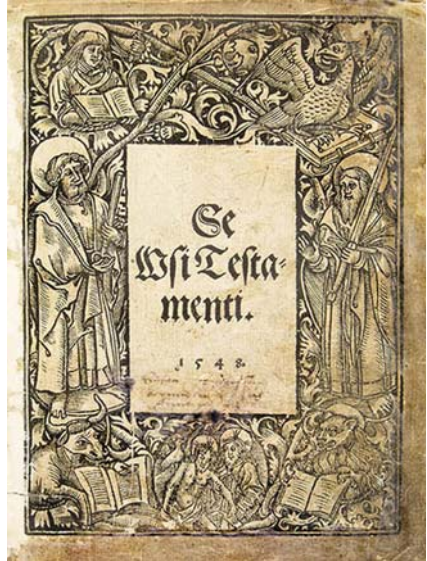
The title page of Se Wsi Testamenti — the New Testament translated by Agricola

Agricola's outstanding achievement was the New Testament in Finnish, translated directly from the Greek New Testament, with Luther's German and Erasmus's Latin to hand for guidance. As Se Wsi Testamenti it was published in 1548. Only five hundred copies were printed, but over one hundred have survived, printed in gothic typeface and well supplied with woodcut illustrations. Between 1551 and 1552 Agricola managed to publish a translation of about one-quarter of the Old Testament, but a complete Finnish Bible was not published until 1642.