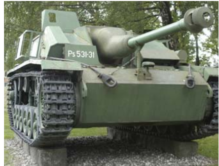
German built WWII tank in Finnish colours

Acquiring its own national parliament in 1906, Finland was the first country in the world to give equal and universal suffrage, the right to vote and to stand for election, to men and women. Twelve years later, 1918 brought brief civil war to Finland, a reaction to the Revolutionary events in Russia, and an even briefer dalliance with the possibility of monarchy. In 1919 K.J. Ståhlberg became the first president of a republican government. The Åland Islanders sought to become part of Sweden. Finland granted them autonomy in 1920, but refused to allow secession: they remain an autonomous part of the state of Finland.